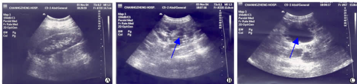
图 1 不同肾脏组织超声检查图像

肾组织中的表达存在显著相关性( r_1=0.8426, r_2=0.9021, r_3=0.8835 , 均 P<0.05 )。