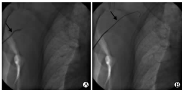
图 2 经 PTCA 导丝置入造影导管技术

除加压包扎, 观察术后即刻至术后 3 d 血管穿刺相关并发症(出血、血肿、迷走反射、假性动脉瘤等)出现的情况; 术后根据患者病情需要常规抗血小板、抗凝, 随访 3 d。